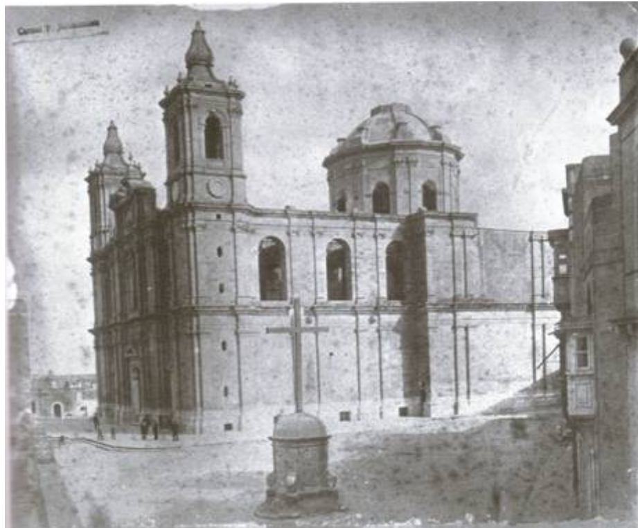
Plate 2 – Gafa's saucer dome without lantern prior to 1907. Note also the incomplete upper cornice at the back

and Salvo Sacco, after being commissioned by the parish in 1907 12 . It was recommended to rebuild the saucer dome with a higher profile and thus will be able to support a lantern. This new saucer dome and lantern were built on Gafa's drum on the design of Mastro Giuseppe Zahra and built by Carmelo Vella, both from Zejtun 13 . The same architects reported on the fact that the upper cornice around the back and part of the side facades was not completed and recommended its completion.