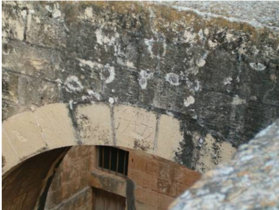
Plate 1 – Date engraved in the keystone in a flying buttress