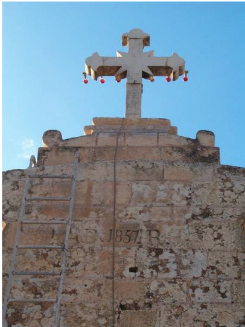
Plate 2 – Date engraved on the back side of the frontispiece

was carried out by the Royal Engineers and a date recording this work was engraved on the back side of the frontispiece (Plate 2).